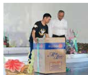
▶ Major prize winner of Gas Range