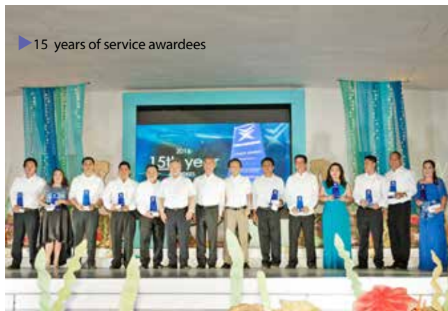
► 15 years of service awardees