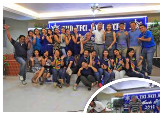
▶ TSUNEISHI HOLDINGS (CEBU), INC. 2016 Christmas party.