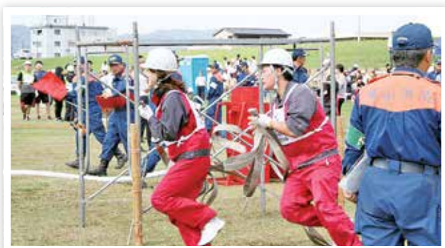
▶ Two competitors work together in laying out a fire hose

The Firefighting Tournament also features disaster drills, in which competitors are challenged to take accurate and smooth decisions and actions when a fire occurs.