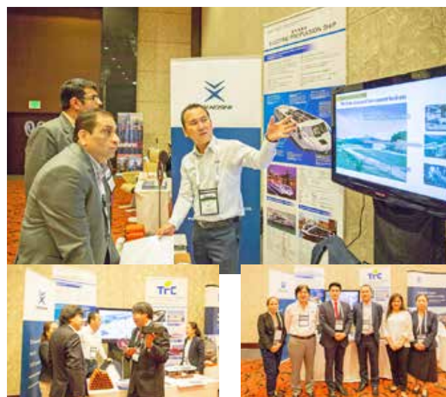
► Much interest was shown by industry representatives from the Philippines, Australia, and Europe

"INTERFERRY" is an organization that seeks to promote and invigorate the ferry industry.