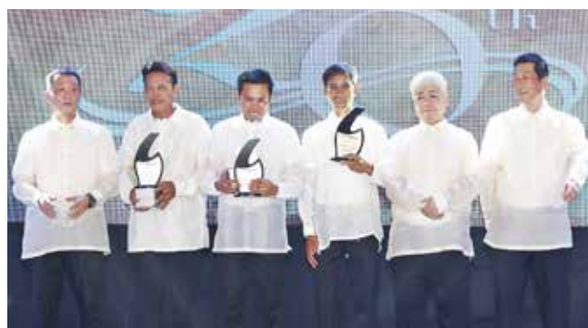
► Tsunetetsu (Cebu), Inc. 10th year awardees during the company's 20th year anniversary.