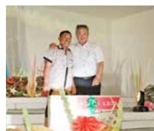
▶ Major prize winner of 40" LED TV