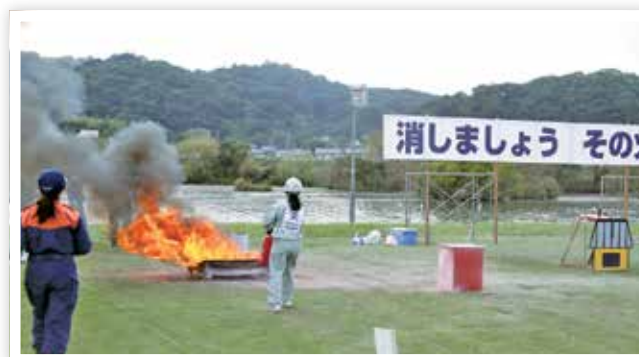
▶ Using a fire extinguisher to put out a fire