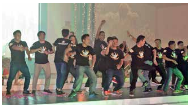
▶ 10-year awardees owned the stage with their funky moves.