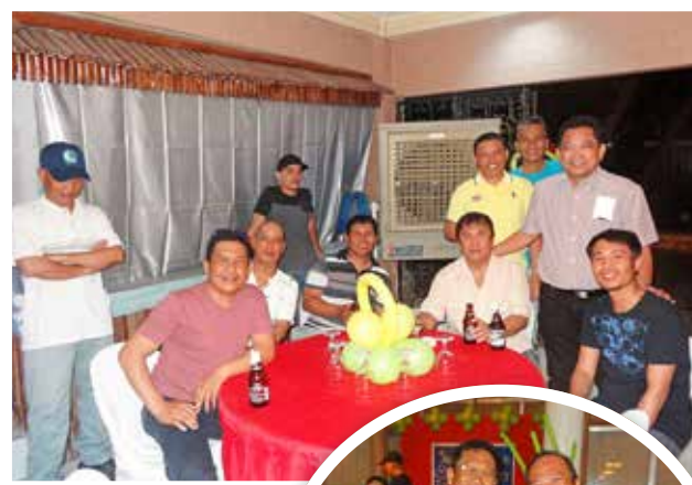
▶ K&A Metal Industries, Inc. 2016 Christmas Party.