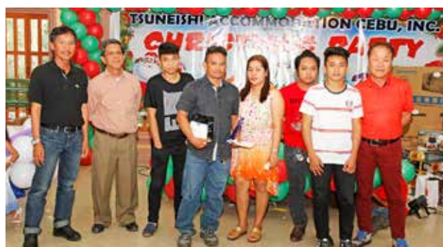
► Tsuneishi Accommodation (Cebu), Inc. service awardee ceremony during their 2016 Christmas party.