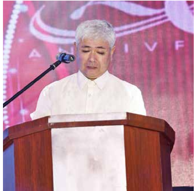
PRESIDENT, TSUNEISHI IRON WORKS CO., LTD.

It is therefore, THI became one of the most important factories of Tsuneishi Group and TCI is as one of THI's best supporter in connection to our ship manufacturing industry.”