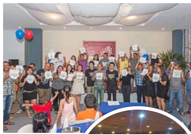
▶ Asian Craft (Cebu), Inc. 2016 Christmas Party.