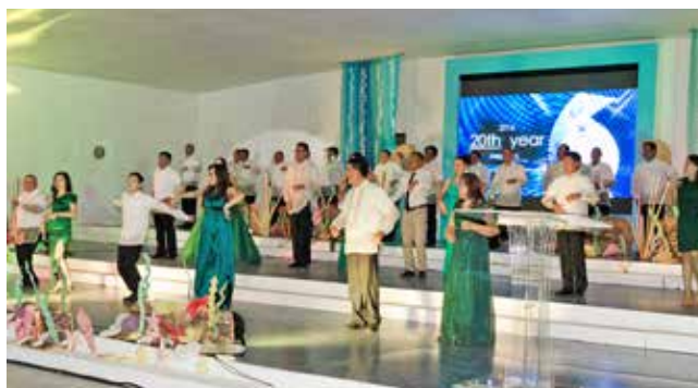
▶ 20-year awardees flaunted their dancing moves.