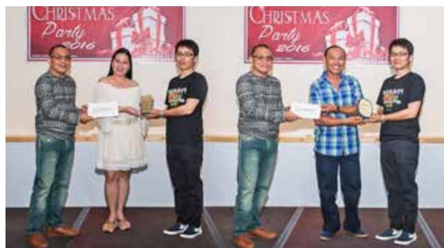
► Asian Craft (Cebu), Inc. service awardee ceremony during their 2016 Christmas party.