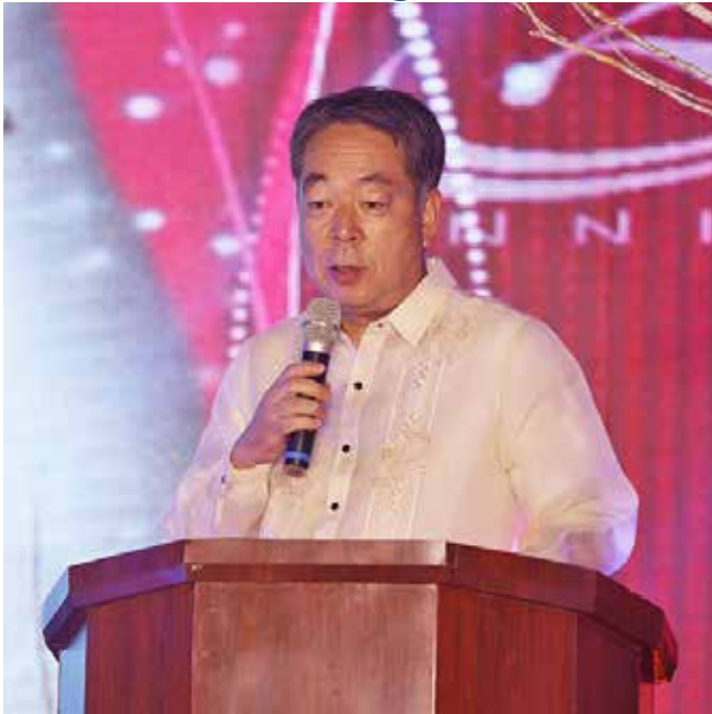
PRESIDENT, TSUNEISHI SHIPBUILDING CO., LTD.