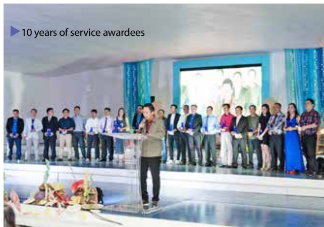
► 10 years of service awardees