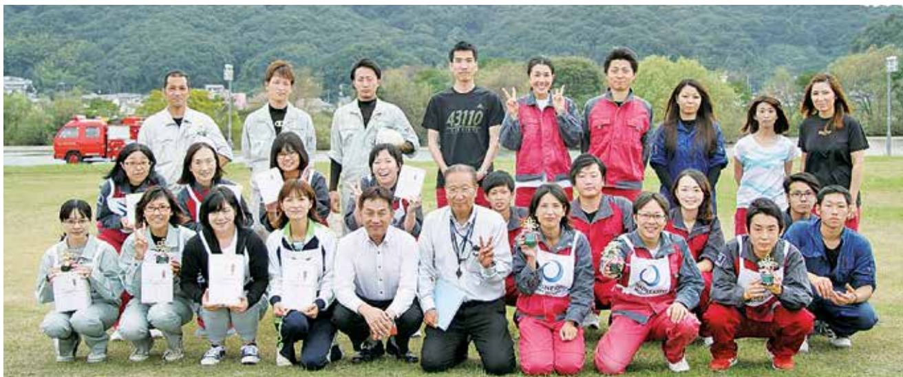
▶ TSUNEISHI HOLDINGS A, 2nd-place winner in Indoor Fire Hydrant Event.

The 48th Annual Firefighting Tournament, sponsored by Fukuyama District Firefighters Association, was held at the Ashida River Sports Park along the Ashida River in Kusado-cho Fukuyama city.