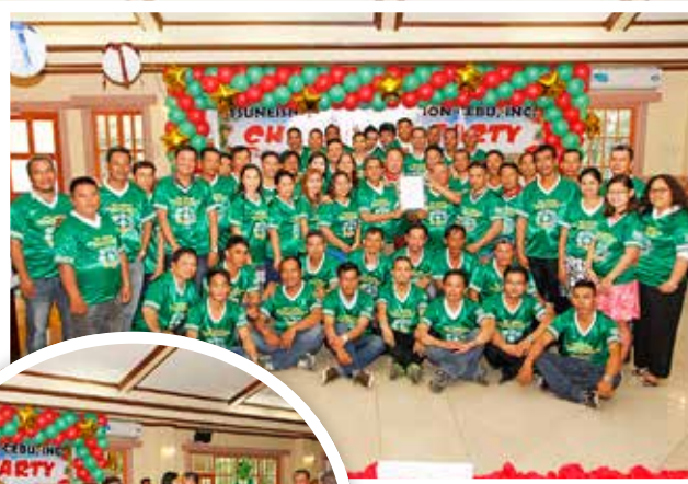
▶ TSUNEISHI ACCOMMODATION (CEBU), INC. 2016 Christmas party.