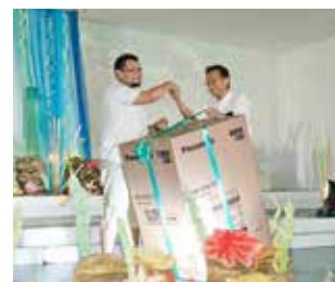
▶ Major prize winner of Refrigerator