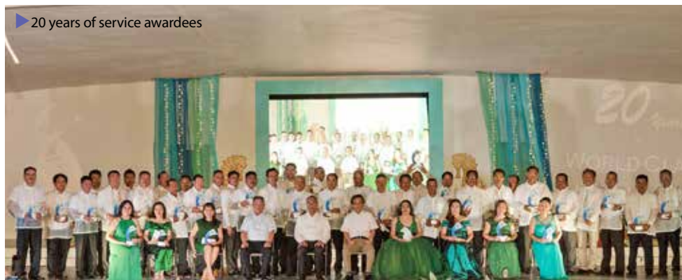
► 20 years of service awardees